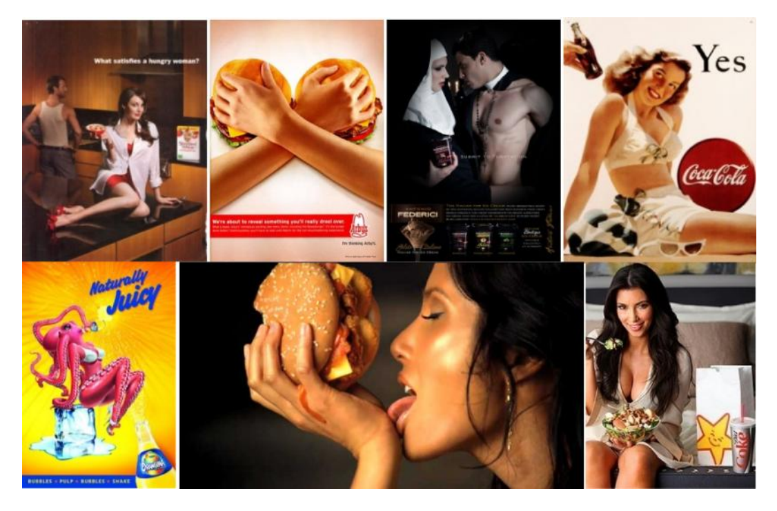
Images and ideas used to promote ultra-processed products exploit sexuality. Some are amusing. Some are bizarre. They all make irrational associations

Whenever it seems a good move, the promoters of ultra-processed products will sex up their propaganda in the literal sense. The idea that a fizzy soft drink could increase sexual attraction has been the basis of a very long series of 'classic' advertisements such as the 'bottle on the beach' image (top, right), cleverly combining allure with a sense of wholesomeness.