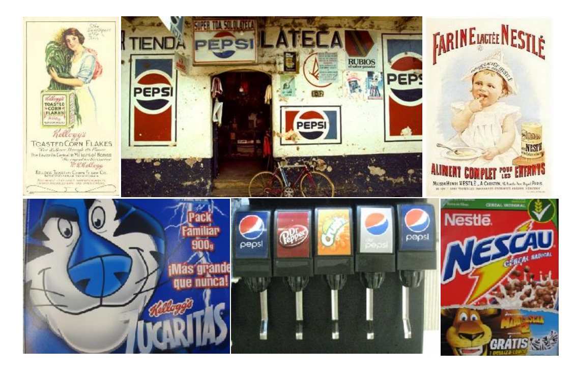
Processed products have been branded for over 150 years. The modern development, is linking company names with the brands of product ranges

Branding has been used ever since industrialisation, and even before then – indeed from time immemorial, if promoting names of makers or products with the purpose of inducing trust, is counted. Branding and trade-marking, whereby names and designs are protected legally, and now may have a value of anything up to $US billions, have been an intrinsic part of the mass manufacture of food and drink products in the early 1800s.