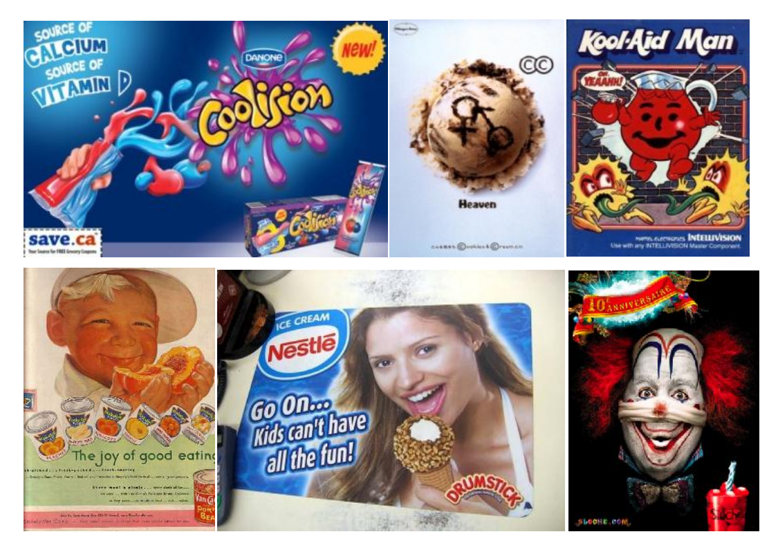
Ultra-processed products are often projected as cool and fun and pleasant for children, who increasingly push demand for them, and also for adults

The projection of imaginary characters magnify the attraction of brands. This works most effectively with children, who are now attracted to products by deals done between the manufacturers of ultra-processed products and multi-media entertainment corporations such as Dreamworks<sup>TM</sup>. Products marketed at children frequently project images and notions of coolness and of fun, as shown above. In a 2010 study published by the Yale Rudd Center for Food Policy and Obesity, researchers found that more than half of the advertisements for 'fast' and other ultraprocessed product advertisements targeted at children used humour and ideas meant to feel fun and cool, to promote their products (20).