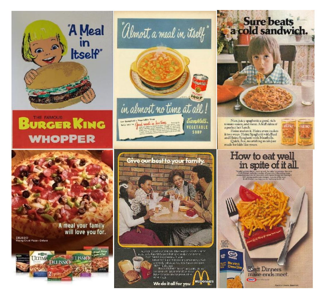
Ultra-processed ready-to-heat or -to eat dishes or snacks advertised as if they are real meals, which even increase the bonds of love within families

Politicians in many countries spend a lot of time complaining about the loosening of family ties, the break-up of families, the rise in teenage pregnancies and single-parent households, uncontrolled children, rioting in the streets, the loss of respect and any sense of citizenship, and so on. As far as I know, no politician has noticed the blindingly obvious fact that ultra-processed 'fast' and 'convenience' products, now very heavily advertised throughout the world, are part of this process. They play a major role in the erosion of family life, in favour of individual 'grazing' and snacking. The meal table disappears, and with it family cohesion.